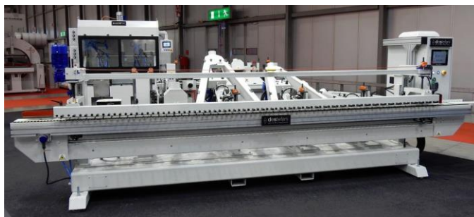
"Destefani Mvt 4000".

The third Destefani sanding machine on display in Hannover is the brand new "MVS Floor" profile brushing/sanding machine. It is equipped to be particularly effective in machining wooden floor elements, ensuring excellent levels of finish not only on the sides, but also on the top surface of the element, creating three-dimensional effects increasingly sought after on the market, which can be obtained extremely easily with this machine. This solution demonstrates the commitment of the group to being a partner of choice in this specific segment of wood processing as well.