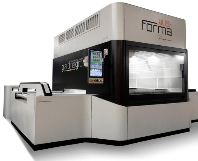
"Dualtech Forma", design by Pininfarina.

Giardina Group will be at Ligna 2023 in top shape with a stand measuring about 300 metres where it will showcase its machines and lines, with a focus on innovation and the ability to effectively meet all finishing requirements. This participation reflects the story of an entrepreneurial journey undertaken over the last few difficult years: from the decision to breathe new life into Destefani , one of Italy's most renowned edge and profile sanding brands, to the partnership with Pininfarina , which has led to the creation of the brand new " Dualtech Forma " automatic sprayer, which is sure to be in the spotlight at Ligna 2023.